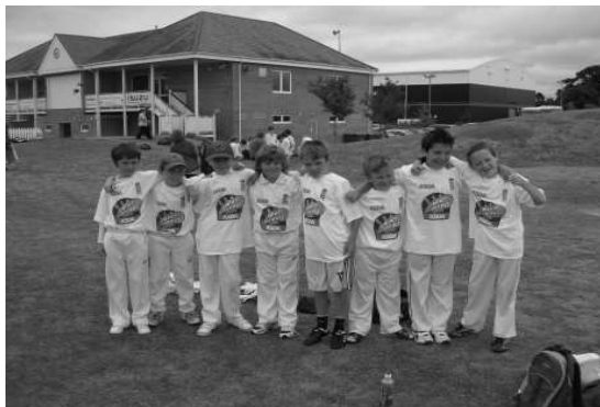
Preston Cricketers at the Somerset Schools County Cricket final