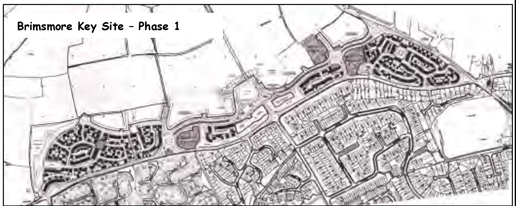
Brimsmore Key Site - Phase 1