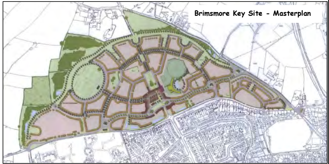
Brimsmore Key Site - Masterplan

The application will be considered by SSDC's Area South Committee in a few weeks time so if you have any comments please let them know.